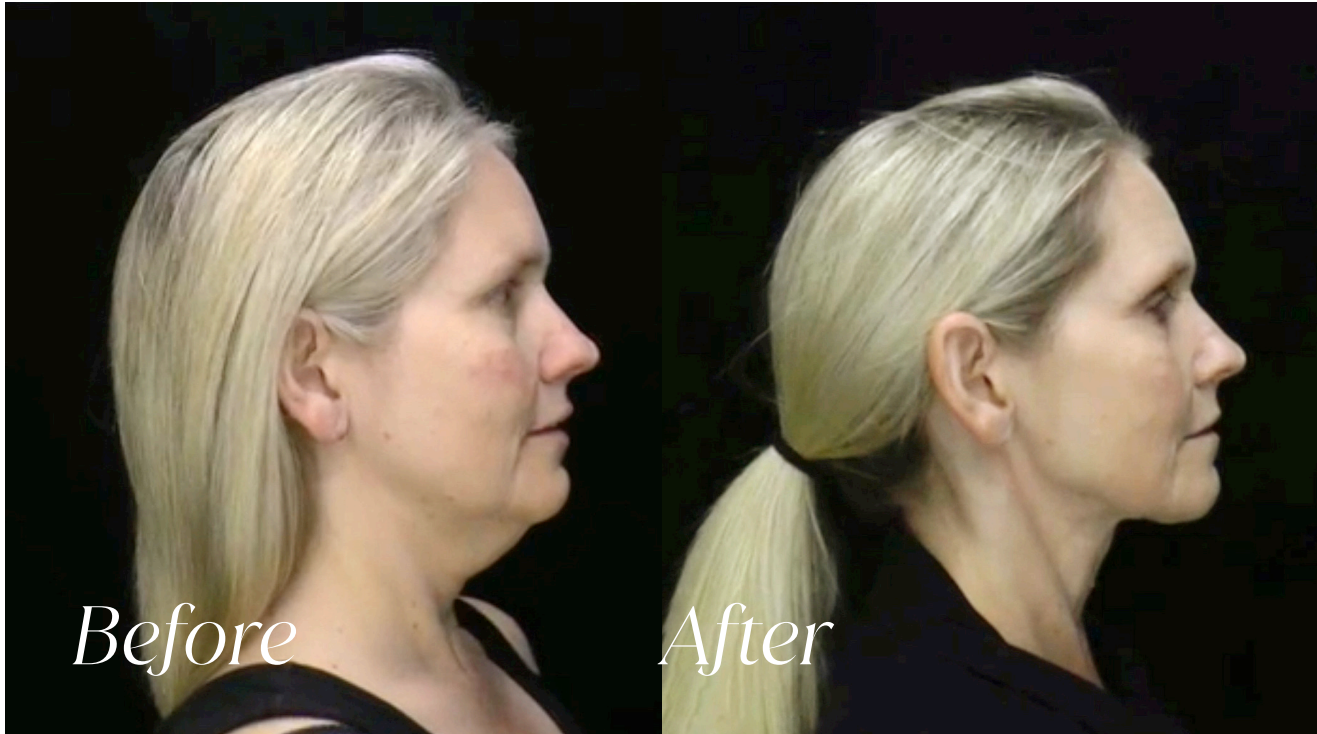
5 years, 9 months post MyEllevate with Smartlipo® Laser Energy